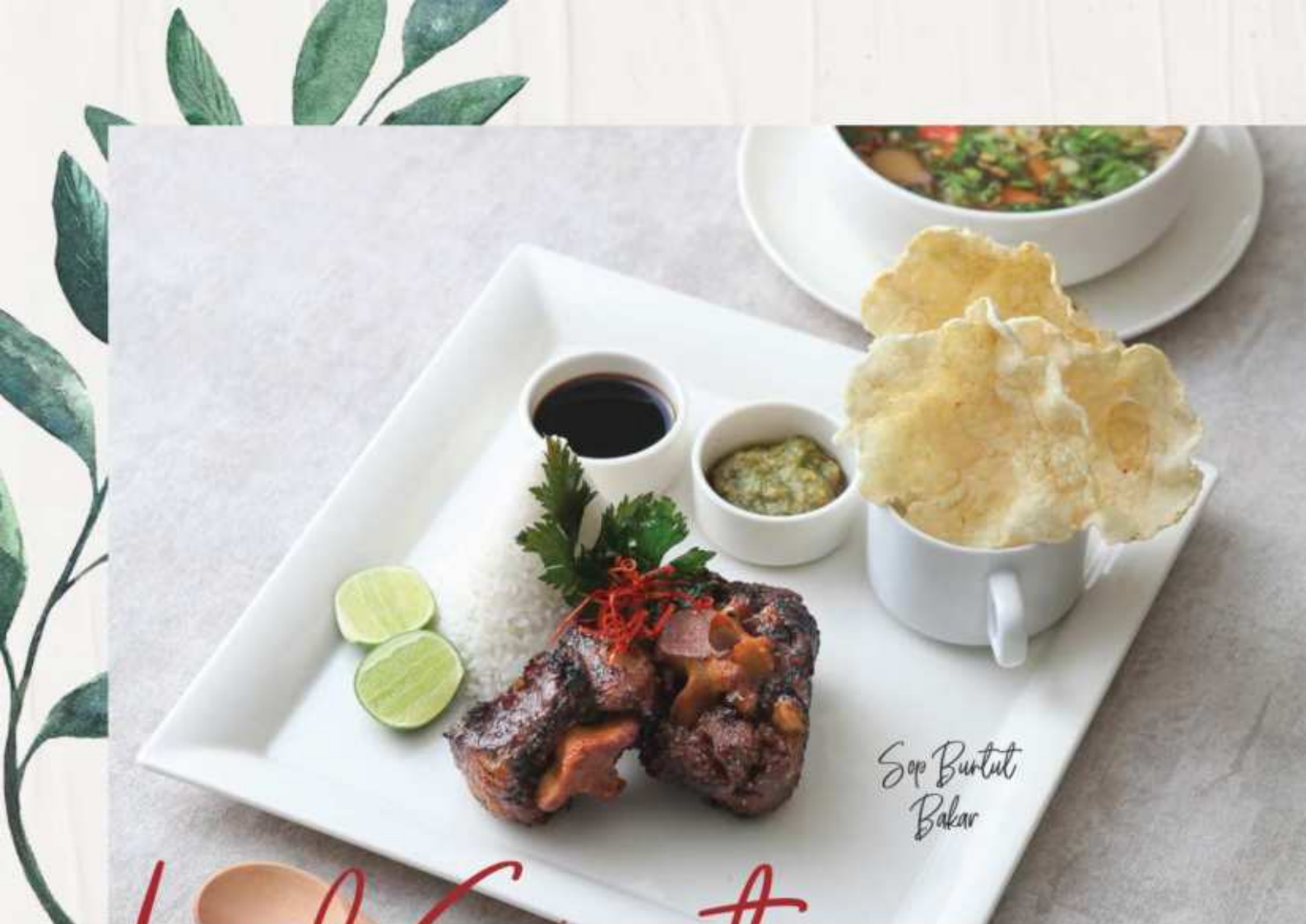
Sop Buntut Bakar