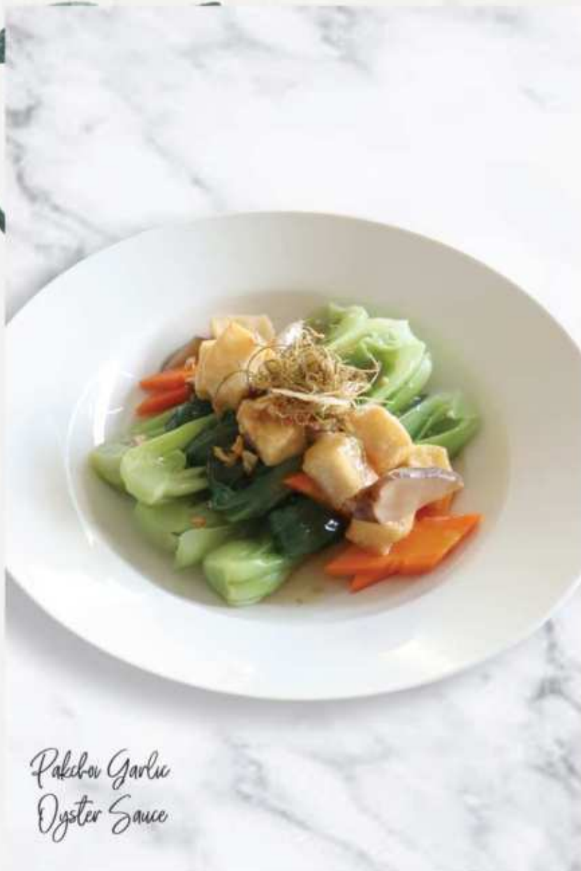
Pakchoi Garlic Oyster Sauce

Tumis sayur kailan dengan saus tauco dan cabai