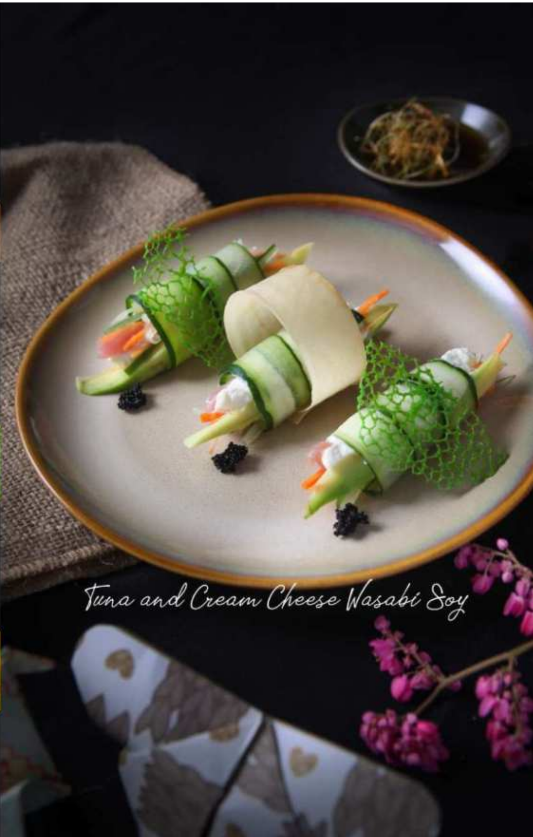
Tuna and Cream Cheese Wasabi Soy

*All prices are subject to service charge and government tax