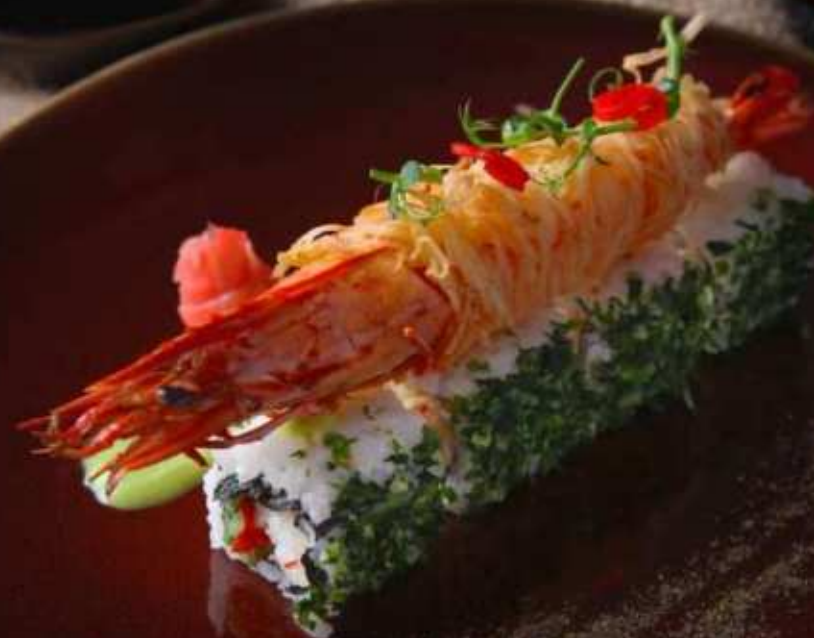
Ebi Tempura Roll

*All prices are subject to service charge and government tax