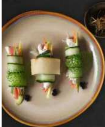
Tuna and Cream Cheese Wasabi

Mini onigiri/ mozzarella/ egg mayo/ parmegiano