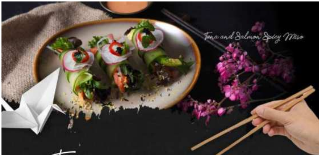
Tuna and Salmon Spicy Miso