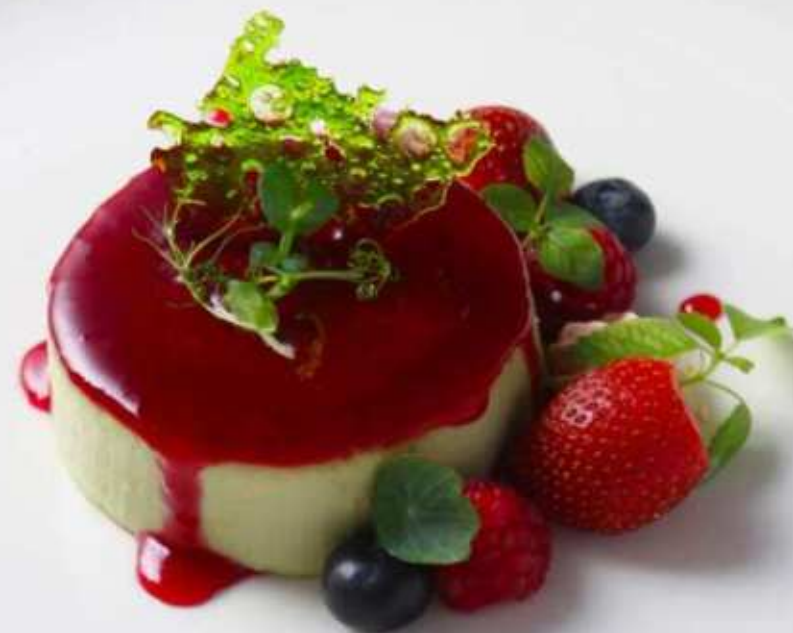
Greentea Custard Brulee

*All prices are subject to service charge and government tax